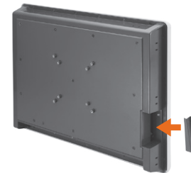
▲ CFast™ slot with protective cover